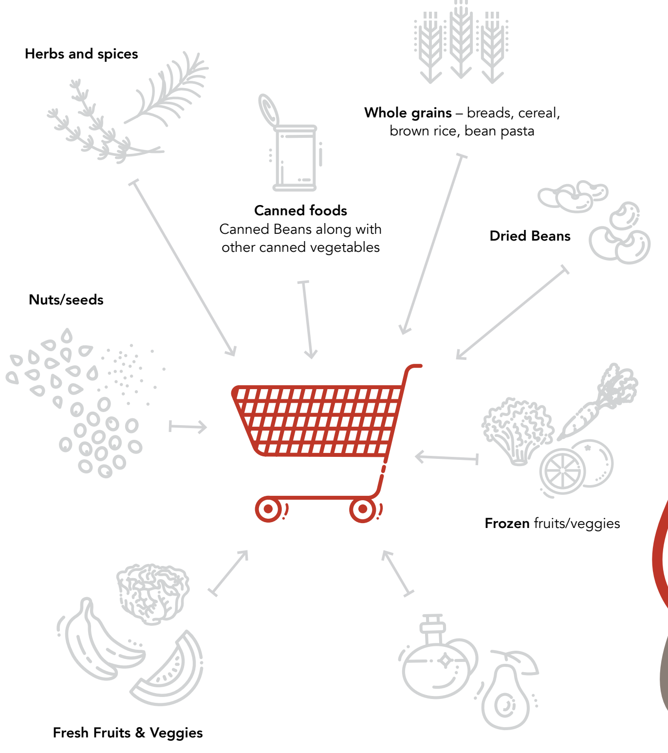
Fats - Olive, canola oil, avocado

Use this easy diagram to help you build a plant-forward shopping cart.